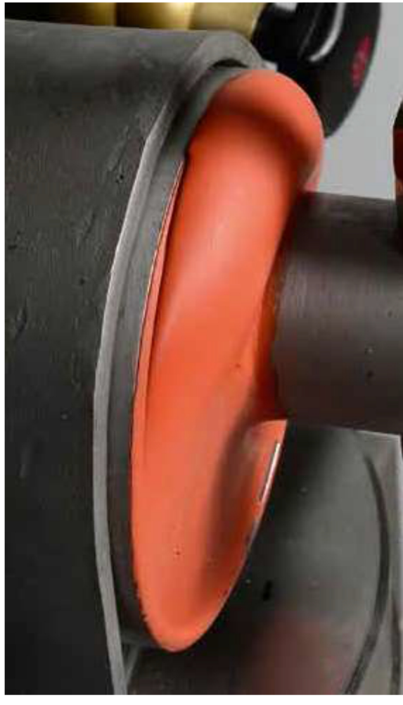
Figure 3. Displacement of the pipeline in lateral direction (perpendicular to the longitudinal direction); the displacement in relation to the transit wall is one sixth of the difference in diameter between the pipe and the transit wall.