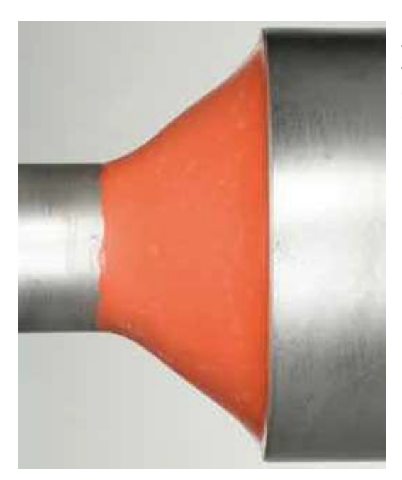
Figure 2. Displacement of the pipe in the longitudinal direction in relation to the outer transit wall with half of the diameter difference between the pipe and the transit wall.